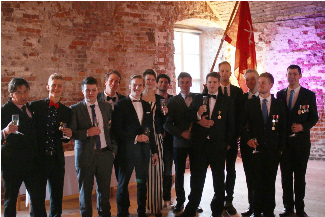
Figure 2: The Danish delegates and old-timers dressed up for the festive NTHS-banquet.

A full overview of the NTHS congress can be found in the separate report on our webpage: www.nul-kryds.dk