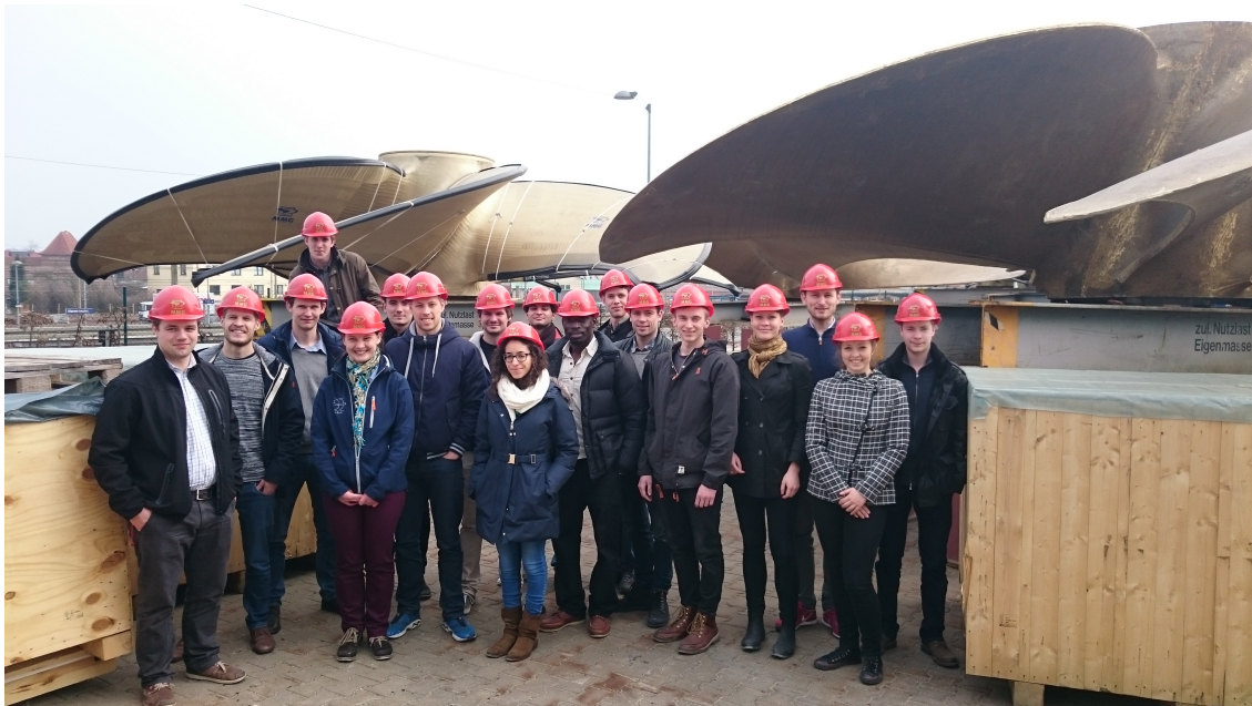
Figure 3: The students lined up in front some large fixed-pitch propellers.

We arrived at MMG, where we were greeted in the conference room with beverages and a nice presentation of the technical projects MMG had been involved in. After a round of questions, we were split in two groups and the tour continued at the production facilities. Here we were presented to the casting process, where several tons of molten copper alloys is poured into massive molds. The tour continued on to the processing facilities where the propellers are provided with precise holes so that they can be mounted on a ship and ground to fit the specific geometries provided by the designers. To meet the geometry specifications of the designers, advanced 3D scanners were used to compare the computer 3D model with the actual propeller blade in the factory. The tour was concluded in the factory canteen, where casual small talk was possible. Good byes were said and the mini-buses full of students headed to back to Denmark and DTU.