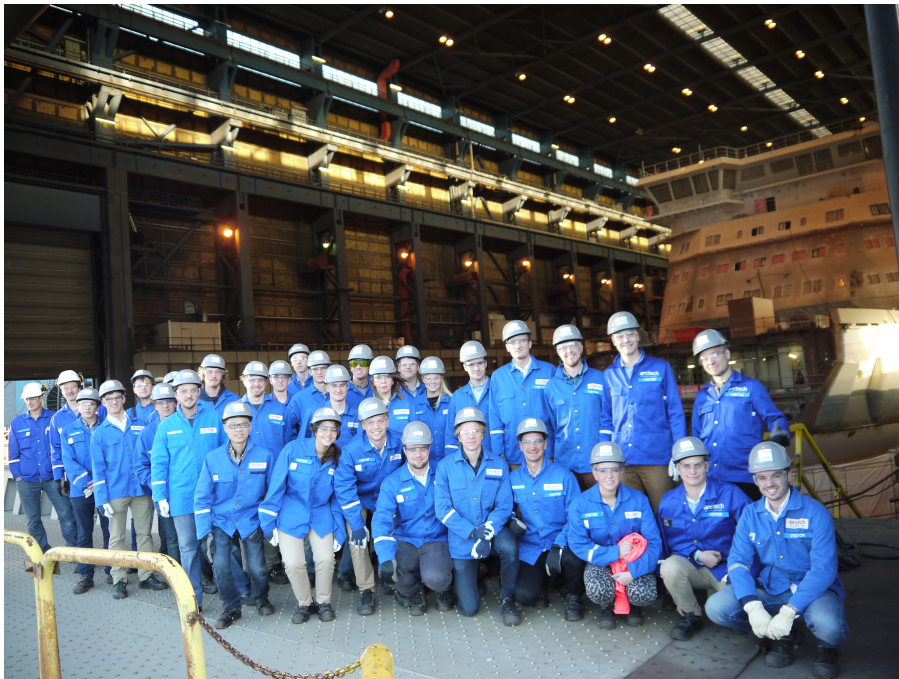
Figure 5: The EMSAC delegates lined up in front of the worlds first LNG powered icebreaker at Arctech Helsinki Shipyard.

It has been decided that Nul-Kryds if possible should participate in EMSAC 2016 as well.