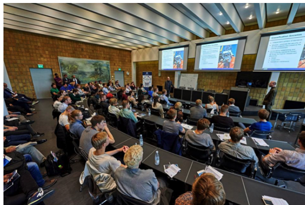
Figure 7: Three presentations were held for the students in order to give them insight into the maritime industry. The board members were amongst the listeners.