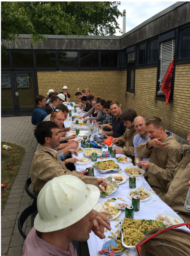
Figure 4: The nice weather allowed us to enjoy the well-cooked dinner outside.

In total everybody had a good evening together with many both old and new like-minded. The picture below indicates just how great an ambiance there is at the Martha evening.