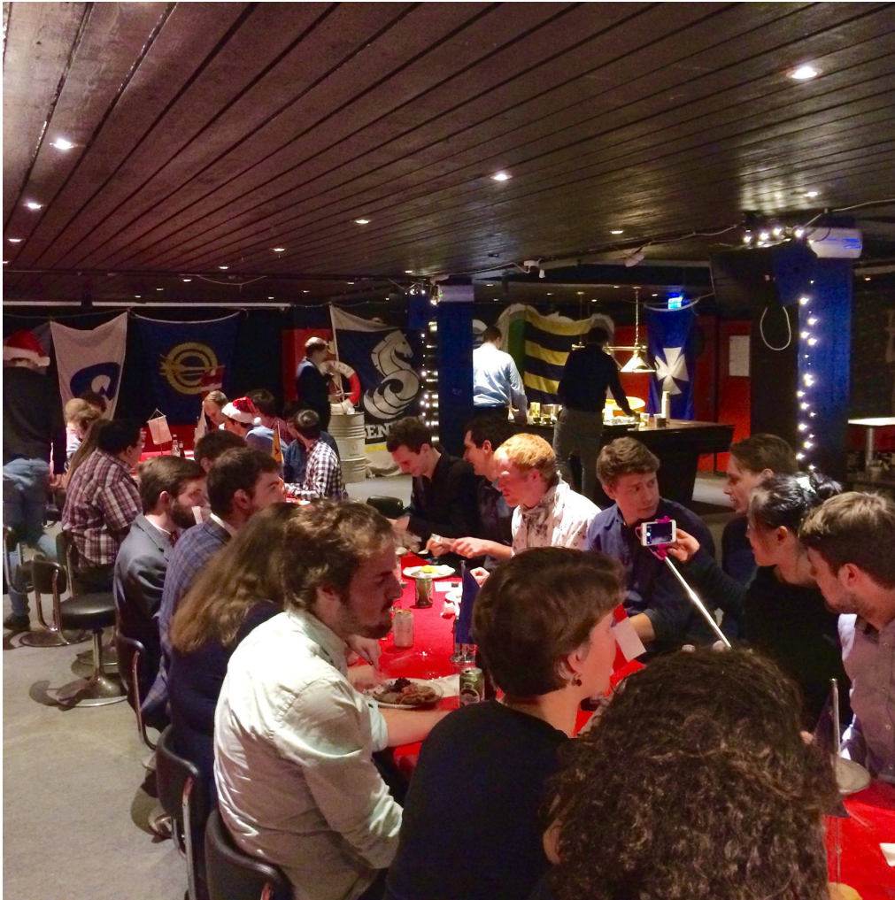
Figure 9: The well-cooked dinner is enjoyed in great company.

The evening proceeded as usual, with plenty of beer, good company and maritime music.