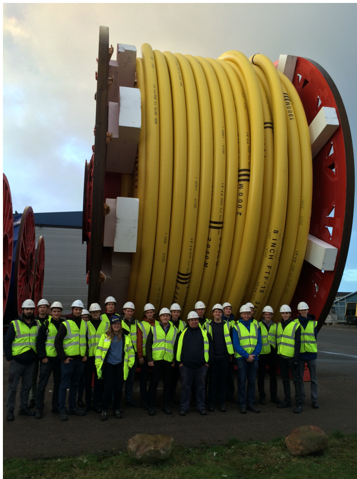
Figure 8: The heavy pipe drums with impressed students for scale.

During the bus trip to the production facilities in Kalundborg safety instructions and an introduction to NOV as a global company in general were given. First the delegation went to watch the manufacturing of the inner and outer metal casing, the quiet impressive continuous cast of the gas-tight plastic membranes etc. Yet again the flexibility of the pipes were underlined as they were rolled on 300 tons' reels. Finally, different stages of end-fitting mounting were observed before the delegation finished an interesting day for which we want yet again to thank NOV.