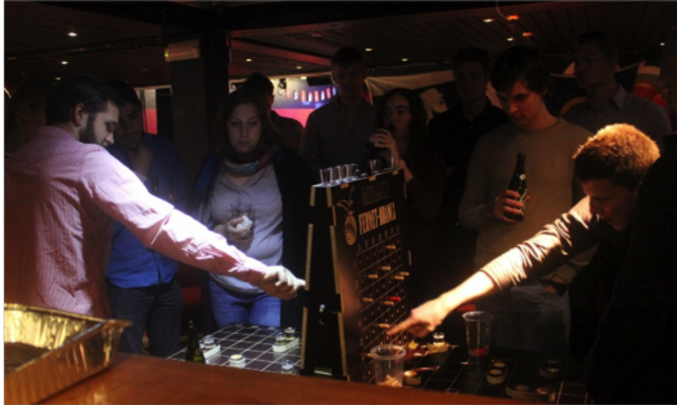
Figure 11: Students gathered around a game of "Sink the Ship".

The 11th of November 2016 was the day of the annual Christmas lunch – the best time of the year. Around 40 people showed up for the festivities! For those who got off early, the doors opened at 16 o'clock. The event was held at Saxen, Kampsax' bar. The evening started with mingling, "glögg og æbleskiver" at around 16.30.