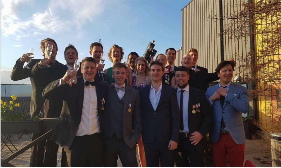
Figure 5: The Danish delegates and old-timers dressed up for a festive banquet.