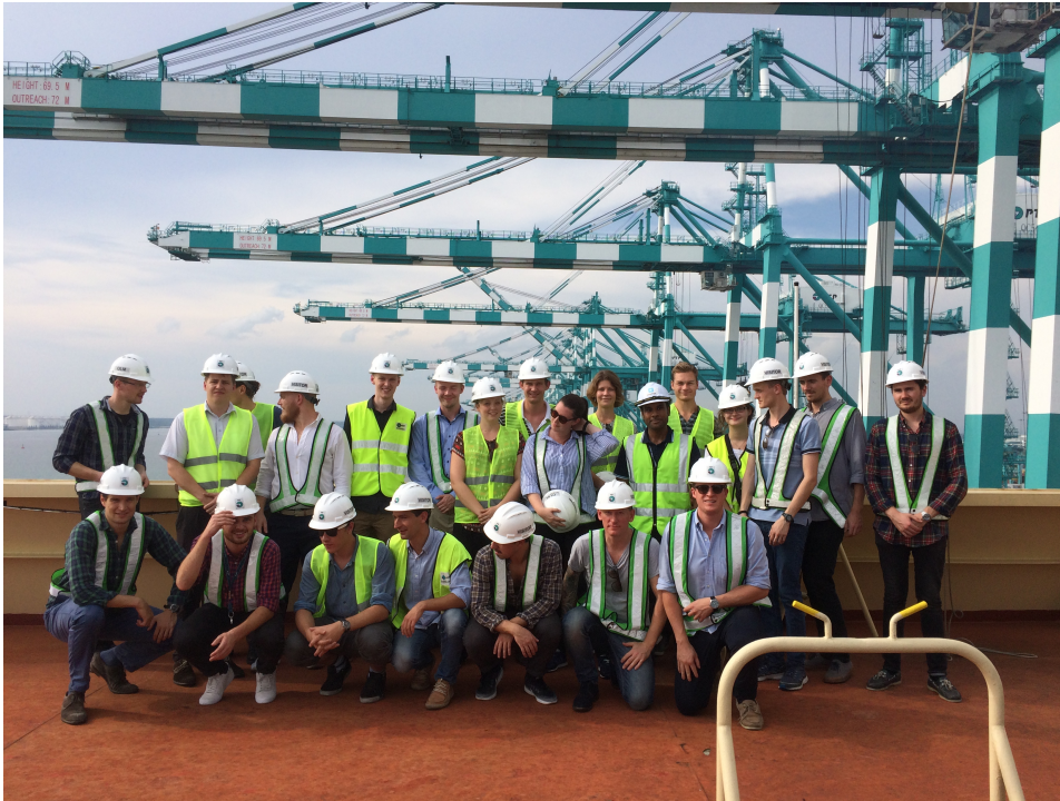
Figure 9: The group enjoying the view from monkey island on Maersk Klaipeda.

The day was spend at Port of Tanjung Pelepas (PTP) in Malaysia - one of the largest container terminals in the world. The first half of the day was a mixture of presentations and relaxed conversations with the employees as we walked around the office and were introduced to different activities. After lunch at a local restaurant we went for a tour of the container terminal and onboard on of the vessels moored at the quay.