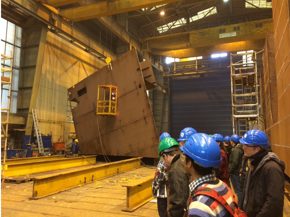
Figure 3: The guided tour at FSG gave the students the opportunity of inspecting ship-building processes at short range.

assembly of these, to what extent finite element calculations were used etc. At the end of the visit the group headed to the outfitting quayside and had a look at the well stimulation vessels Siem Helix 1 & 2. Here stability and measures to increase or decrease this at the end of a construction were discussed along with opportunities for and benefits of working in the borderlands. After some boarder-shopping the group headed back for Copenhagen after a long but enriching and inspiring day.