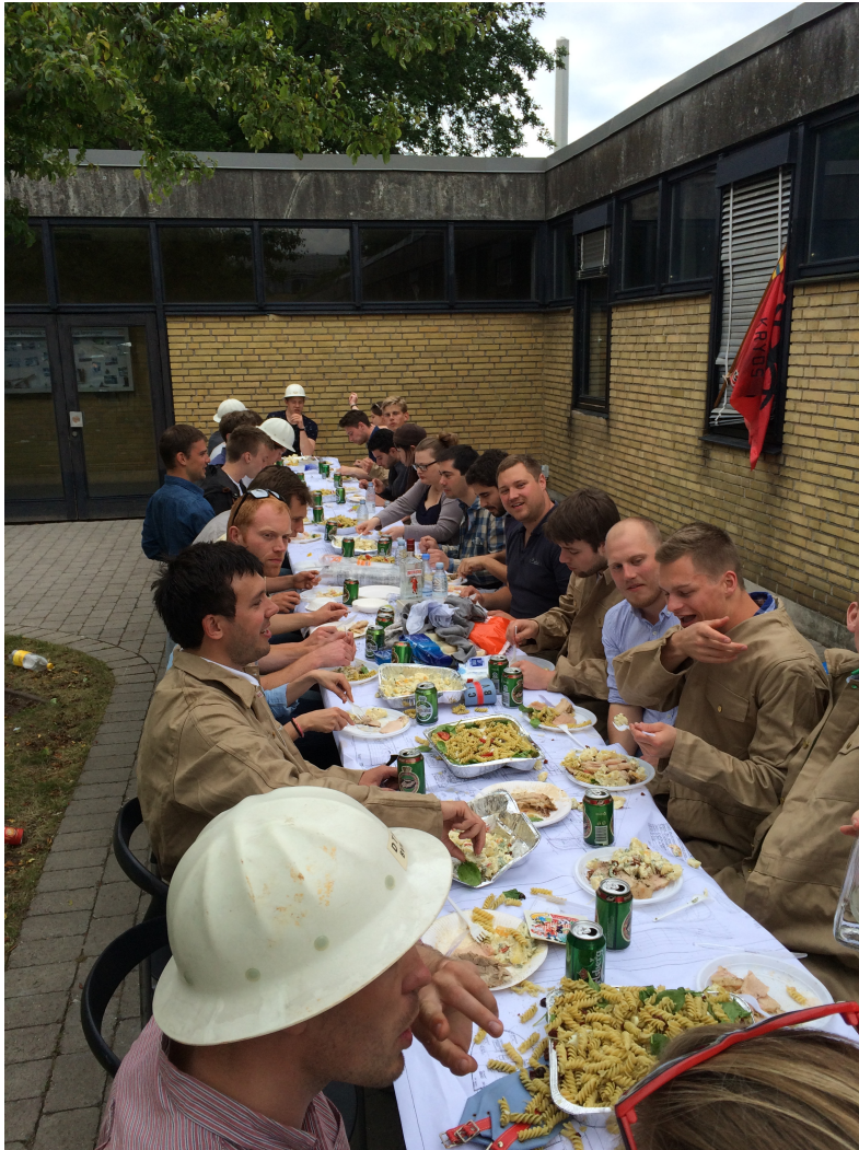
Figure 6: The nice weather allowed us to enjoy the well-cooked dinner outside.

As previous years a much cherished event was hosted by Nul-Kryds: the Martha evening. A lot of energy was put into preparing the garden outside of building 402, to frame the festivities of this evening. This included maritime flags in the trees, the traditional table cloth depicting the good ship S/S Martha and much more. After all attendees had arrived the festivities were moved into a close by auditorium, where we watched the cult classic S/S Martha as always this involved plenty of cheerful songs. As tradition dictates O.P.Andersen snaps was readily available, as well as soda and beers. Later the activities moved out into the garden again, where the Nul-Kryds board had prepared a feast. The food included pulled pork, coleslaw and buns for building a nice burger. The festivities went on well into the night, leaving plenty of room for socializing with friends, colleges and other students. Also activities like anchor throwing and nail-games were practiced throughout the evening. We look very much forward to hosting the next Martha evening. We have no doubts that it will provide an equally good atmosphere and hopefully help the social environment on our line of education.