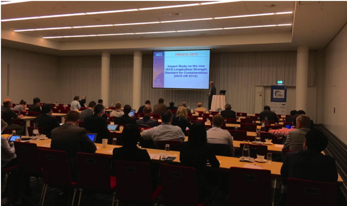
Figure 7: Presentation during the PRADS symposium held at the Crown Plaza hotel, Copenhagen.

The efforts given by the Nul-Kryds team were well recognised by the organising committee and the overall symposium was a great success in further establishing Denmark as a leading maritime nation.