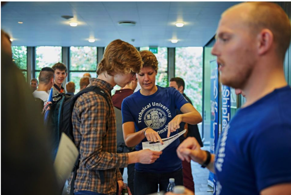
Figure 10: Nul-Kryds members guiding student colleagues at Tech Event.

In late october Nul-Kryds participated in a game-night to test the "TECH game" that was to be played by participants in Det Blå Danmarks 'TECH event'. The game should give an introduction to the many different aspects of and career opportunities for engineers within the maritime field. The "TECH game" is played in teams, it is fast paced and the players must relate to a lot of different material in relatively short time. In the end the team that chose a 'project leader' and divided the tasks to 'specialists' won the game, albeit scores were tight until the very end. After having been played, the game was discussed and several recommendations were given. For Nul-Kryds this was a completely new thing to participate in, but it was a very fun experience.