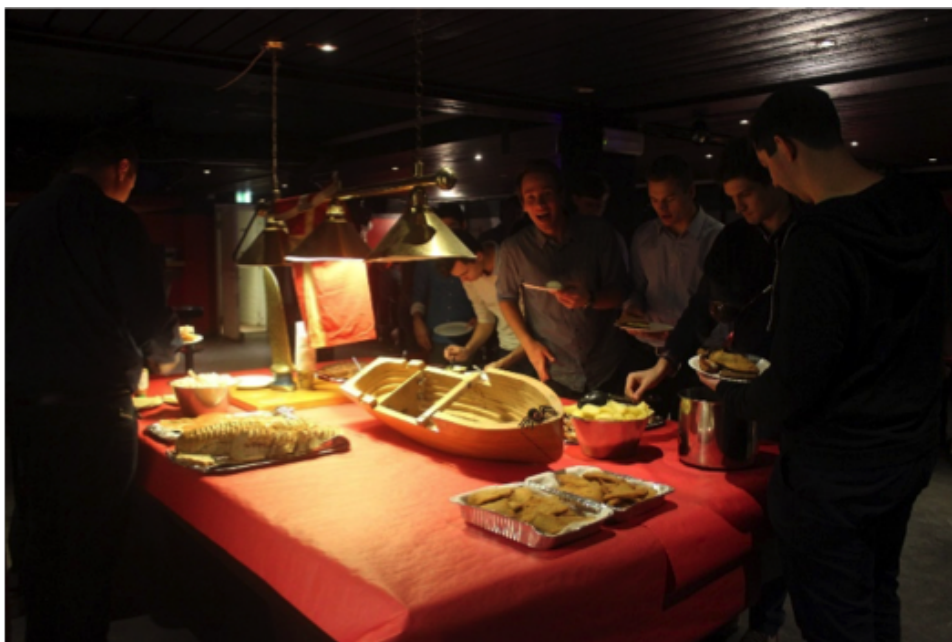
Figure 12: The feast is served.

The best part about the Christmas lunch is the atmosphere. Everyone is welcome, new members as well as old-timers. It is the perfect chance to get reacquainted with old friends and make some new ones. No one is left out. No one was sitting sad in a corner – everyone was having fun - smiling and talking to each other. In the hours before the main course was served, games were played, both "Sink the Ship" and foosball were particularly popular.