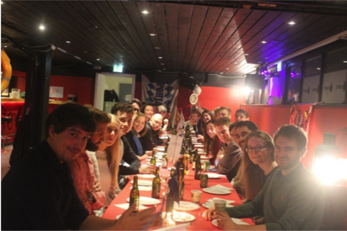
Figure 13: Both old-timers and students gathered for a cheerful evening.

The fun lasted all night long, and everybody had a great night and loads of memories.