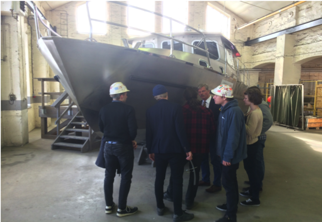
Figure 4: The Danish delegates inspecting a lightweight yacht design at Swedish Steel Yachts.

The 69th Nordiske Tekniska Högskolas Skibbsbyggare (NTHS) congress was hosted by Kongliga Skeppssällskapet from KTH Royal Institute of Technology in Stockholm during week 15 of 2016. During the congress, a wide variety of companies were visited along with fun-packed activities and interactions among the participants. Through the company visits the delegates explored the recent developments in the Swedish maritime industry focusing on state-of-the-art yacht designs, lightweight materials, underwater craft solutions and alternative propulsion devices, among other exciting technologies.