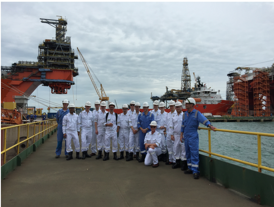
Figure 8: Group photo at Tuas Yard.

We drove to Tuas Yard right after breakfast, where we were lucky enough to spend the full day. The day started with a security briefing and presentations about Tuas Yard and the process of designing a Floating Storage and Offloading (FSO) unit. The presentations were in depth and very technical - much to the delight of the group. After the presentations, we went on a tour of the yard. The size of the yard and the countless workshops left a strong impression on all participants.