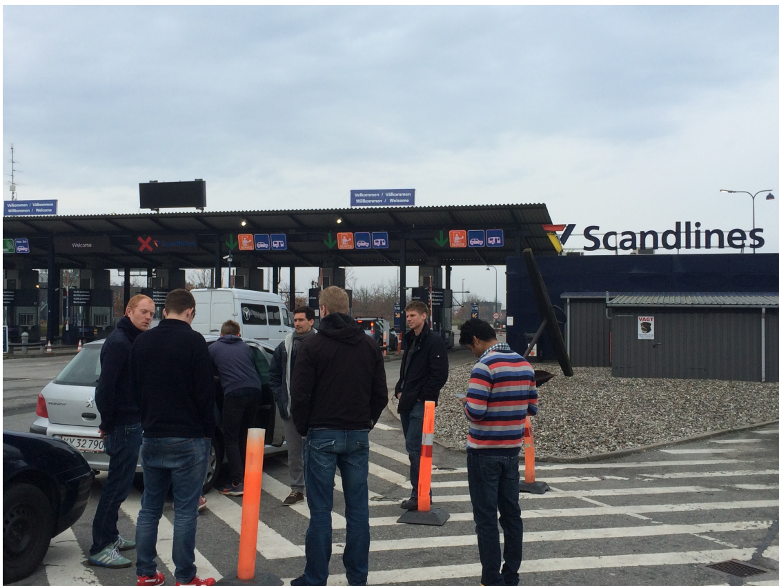
Figure 2: Morning fresh students ready to embark the M/F Prinsesse Benedikte.

During the crossing from Rødby to Puttgarden with Prinsesse Benedikte the chief engineer kindly hosted a fine breakfast combined with a technical presentation of the hybrid system. First the considerations during the development and installation of the system were presented, followed up with a real time look at the system as the ferry left the harbor. During acceleration in the shallow water the system really showed its fuel saving possibility as lots of the required power were provided by the batteries. Following the presentation, the group went down into the engine room and had a look at the two generators running and the battery pack, taking up the space where a generator was installed previously. Many questions were asked, the cooling of the batteries gained much attention as well as the actual fuel savings. Compared to the first year of service in 1997 the fuel consumption was reduced to almost half the amount.