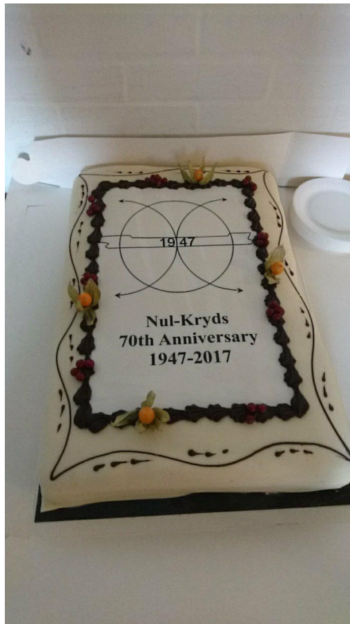
Figure 6: The cake for the 70th anniversary.

We can only say that we hope that Nul-Kryds will take another 70 years!