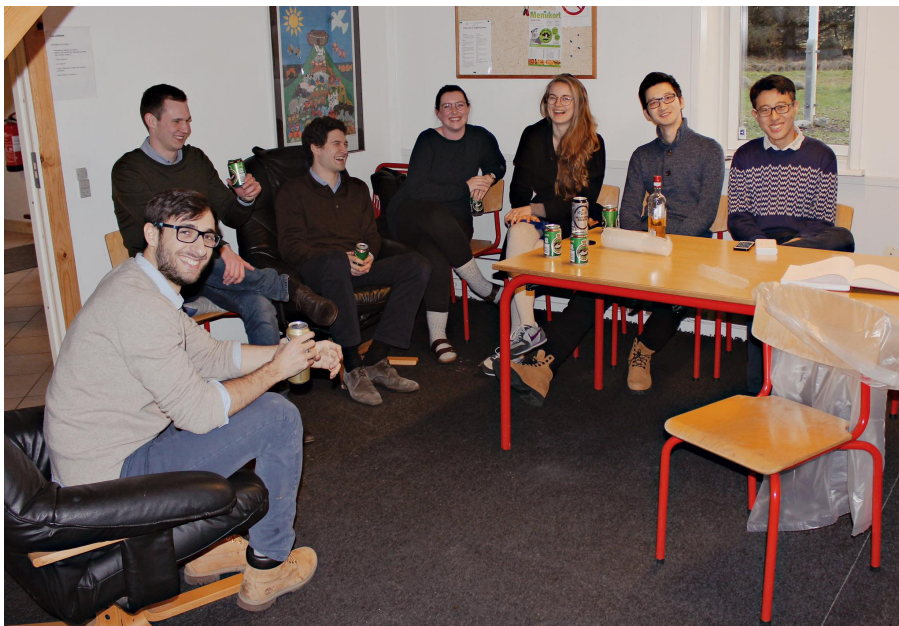
Figure 2: The scout hut - the only place where pictures were allowed.

Lastly, on our way back the Århus and Mols-Linjen we visited the testcenter of Alfa Laval in Aalborg. This was a magnificent experience as the testcenter offers unique possibilities for access to engine room components that are otherwise so closely packed that giving a presentation around them can be challenging.