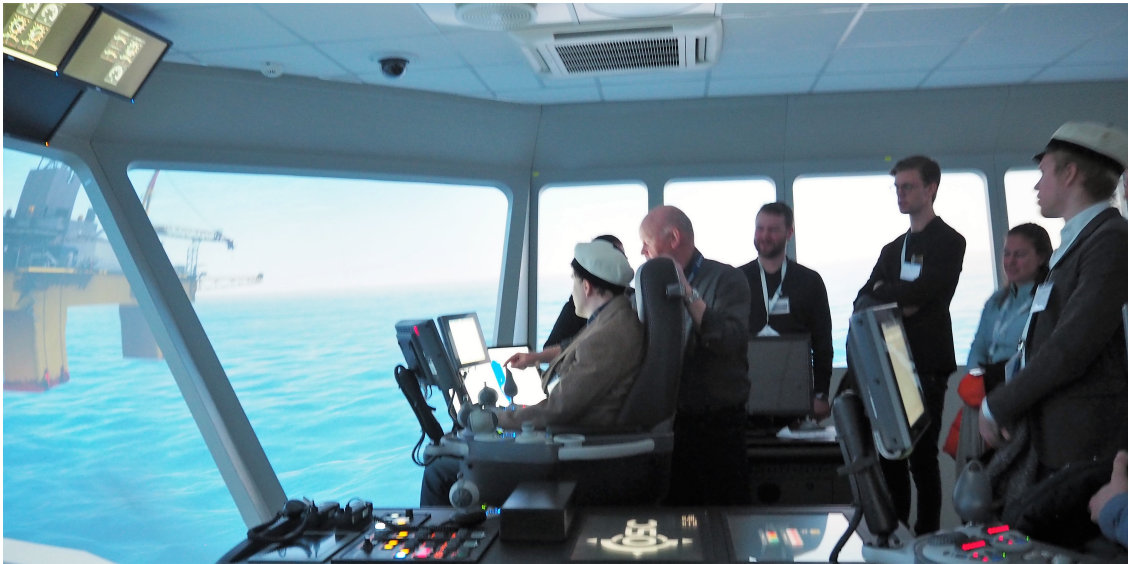
Figure 4: Some of the participants testing the simulator.

Company presentations and visits included the production of coolers and compressors to the oil and now the fish-farming industry to thrusters, state-of the art diving vessels, a live demonstration of ship simulators using the newest technology available, and a full workshop hosted by the main sponsor, DNV-GL, about the visions for and role of the shipping industry in the coming years - and pretty much anything in between. As can be seen the congress was very diverse and was even more interesting because the company present covered the full range from small family-driven businesses to global giants, thus giving a very good idea about the diversity of the Norwegian maritime industry.