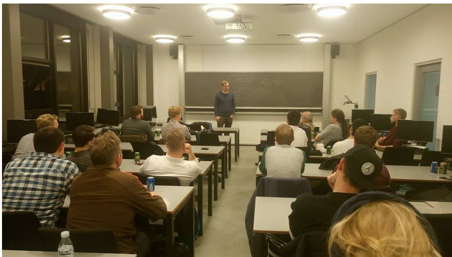
Figure 8: The participants listening closely while enjoying cold drinks.

The presentations invited to a range of questions from the students and gave them good first hand information about danish start-ups in the maritime industry. There was a keen interest in start-ups as it provides an opportunity to work more independently with own ideas and projects. The evening ended with networking where the students could get more detailed answers to their questions and have a little chat with the speakers.