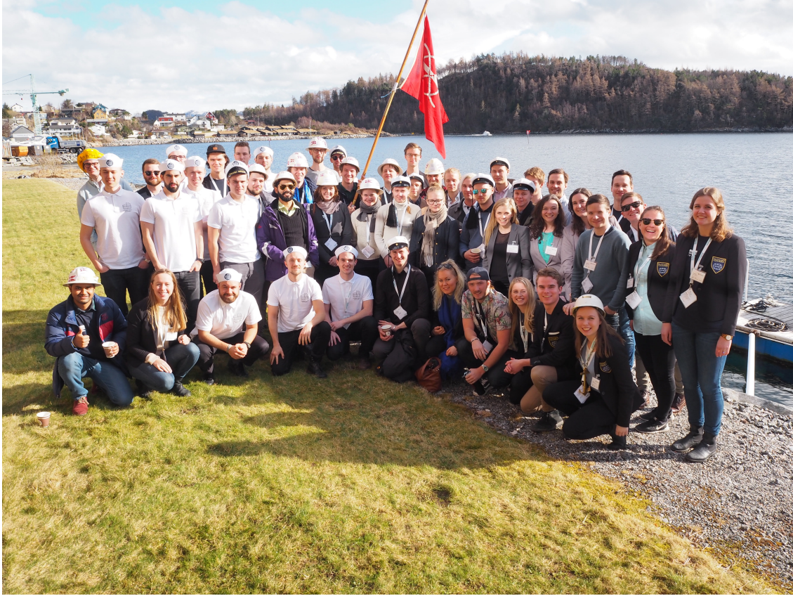
Figure 5: All participants of NTHS70, the red flag of Nul-Kryds can be seen in the background.