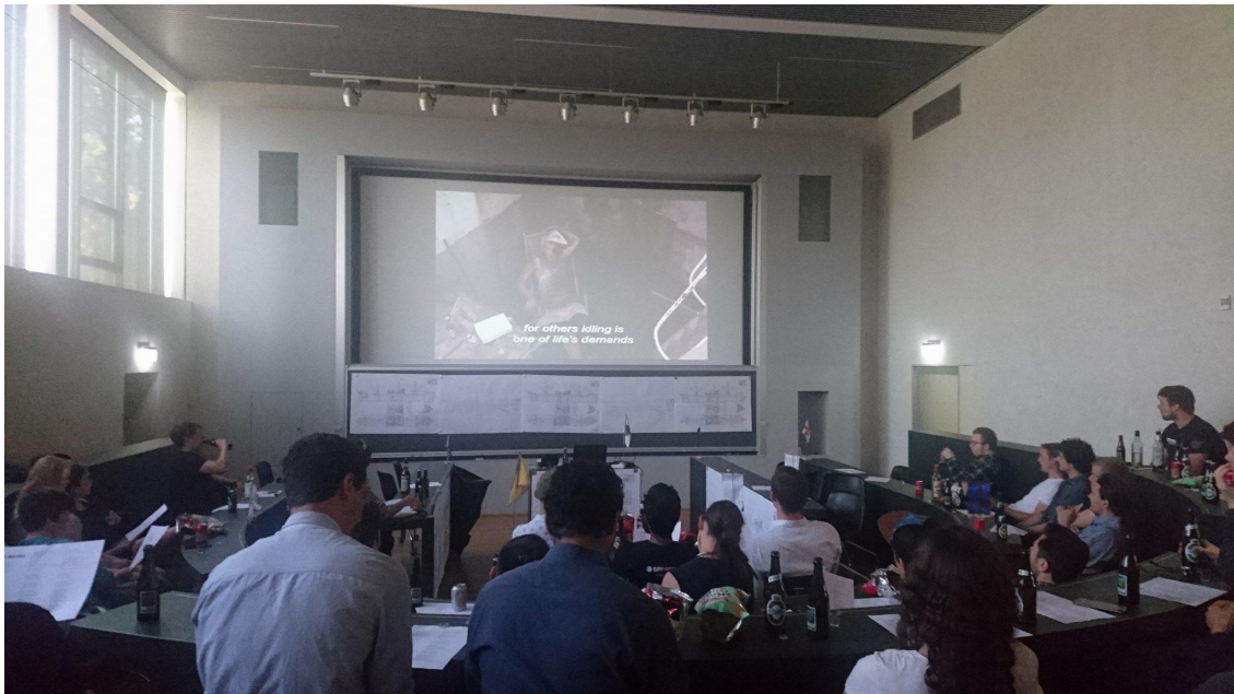
Figure 7: The participants watching S/S Martha.

We look very much forward to hosting the next Martha evening and hope to repeat this years success. We have no doubts that it will provide an equally good atmosphere and hopefully help to strengthen the social environment on our line of education.