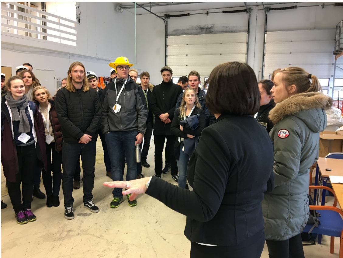
Figure 3: A brief introduction to fish farming before a tour to see the nets being repaired and produced.

Being part of NTHS is always a great pleasure and is a guarantee of an interesting and challenging week with loads of company visits. Although we knew that the Norwegian delegation had been on top of the planning process of the congress through the entire year, we were still excited to see the Norwegian industry, which was strongly affected by the reduced oil-prices and had, as a consequence, downsized considerably. Throughout the five days and more than 15 company visits and presentations we were consistently surprised and intrigued by the companies ability to reinvent themselves, innovate and adapt to a rapidly changing market.