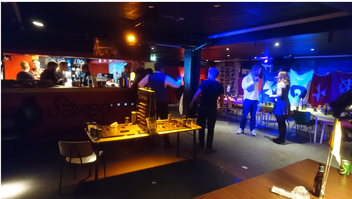
Figure 9: The participants having a good time in Saxen.

The great thing about the Christmas party is the atmosphere. This is the party which everyone is looking forward to. We therefore look forward to the Christmas lunch next year where we hope to see as many old-timers and newcomers.