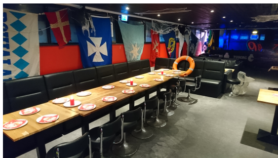
Figure 6: The table arrangement in Saxen for the annual Christmas Lunch as it was in 2019.

The annual Christmas lunch should have taken place on the 7nd of November 2020 as this was the first Saturday in November. A sad tradition to miss out on - but we can hope for a realization of it in 2021. Normally this is an event where current students have a chance to meet old-timers of the student union Nul-Kryds. While having fun and meeting with old friends, it is also a great way for international students to get to know the Christmas traditions of Denmark. It suits as a perfect opportunity to broaden your network in the maritime industry.