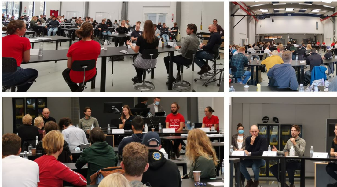
Figure 2: Tech Event for the Mechanical Engineering students on their first semester.

We hope to see many of the students in Nul-Kryds at some point and that such events can continue as annual events so new Mechanical Engineering students at DTU are introduced to the maritime industry.