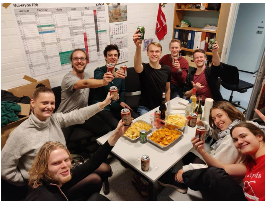
Figure 1: High moods for those who took part in the ancient, social and yet invigorating and healthy event: the Sauna evening.

This years evening took place on February 7th and around 12 Nul-Kryds members and old-timers participated. The evening started with a vitalising dinner, preparing body and mind for the journey that was to come. Then followed the namesake of the evening, Sauna! If you still doubt the power of meeting new people while sweating, having same interests (more or less) and drinking a beer or two, you surely have not tried the Sauna evening.