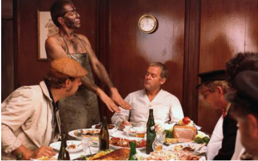
Figure 5: The menu was not as in the movie, but the hands were clean! Corona safety above all else!

So without promising too much, then we will stick to this tradition at least a bit more, maybe with a fresh twist or two in the coming spring.